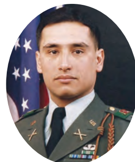
Battery Commander, B Battery, 2-41 Field Artillery, 3d Infantry Division, Bad Kissingen, Germany, 1987. Mission Accomplished! Rock of the Marne!