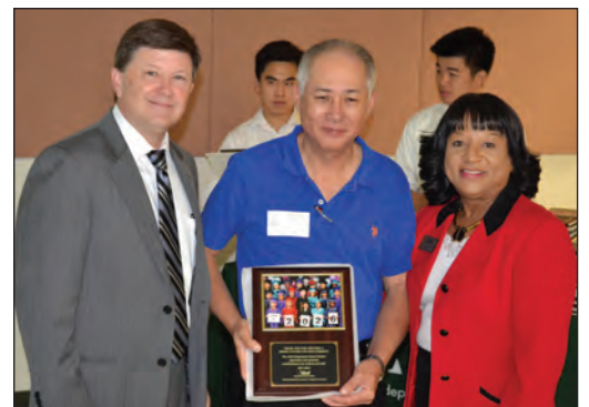
Alief ISD recognized CAMP for its contribution to the children of the district.

More information available at www.HoustonAgs.org .